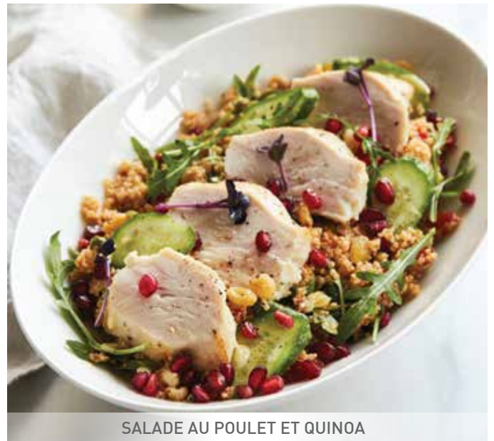
SALADE AU POULET ET QUINOA

Smoked salmon platter, capers, lemon wedges and mix lettuce